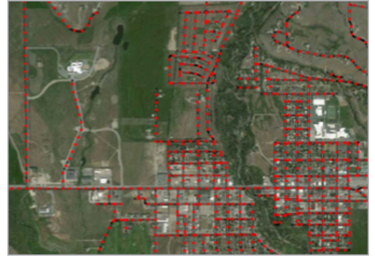
Urban planning: Fine detail editing of individual lines