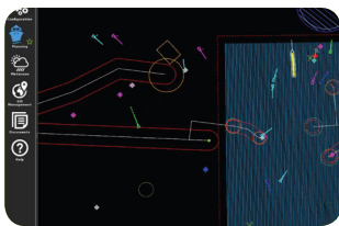
Reduced HSE risk in complex SIMOPS situations