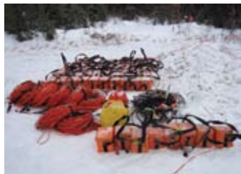
ARIES is a cable-based seismic recording system designed for use in all environments

ARIES is the first land acquisition system by ARAM that offered programmable and upgradeable on-board logic in ground electronics, and multi-path telemetry with variable, programmable transmission frequencies and data retrieval rates. Since the 2000 introduction of ARIES, ARAM has continuously improved the design, capacity and overall flexibility of the system with more than 200 enhancements that have contributed to reductions in power consumption, increases in channel bandwidth, expansions in QC functionality, and improvements in uptime and field productivity. ARIES is a cable-based recording system complete with rugged ground electronics, intuitive system software and field-proven technology for land and transition zone operations