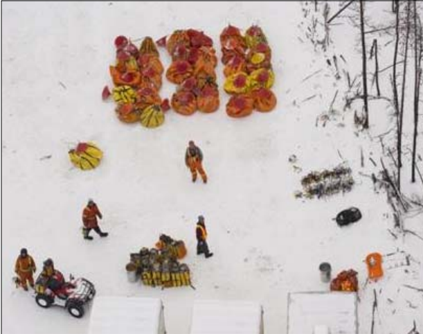
The seismic crew is staging the Scorpion System equipment after it was delivered by helicopter.

The application of the full-wave solution in this case involved Oilsands Quest as the E&P operator, ION as the technology and imaging equipment manufacturer, and Geokinetics as the owner of the full-wave equipment and provider of field acquisition services. The three, 3-D seismic programs were completed in 100 days, utilizing Scorpion, ION's cable-based land acquisition system with 6,500 VectorSeis digital full-wave receivers. The seismic acquisition platform utilized a live spread of 2,400 stations per shot (7,200 channels) configured for full-wave recording using 3C VectorSeis receivers at a 10 meter spacing interval.