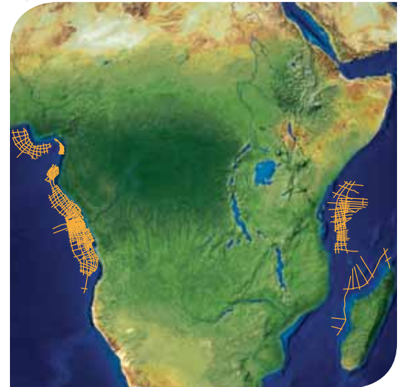
image deep within the crustal architecture offshore Angola. The insights delivered by the initial program resulted in a series of AfricaSPAN™ programs extending from the Cameroon volcanic line to the Gulf of Guinea. This was followed by the launch of ION's GX Technology (GXT) imaging centers in Luanda, Angola, and Port Harcourt, Nigeria, the last in partnership with an indigenous partner – Bulwark Services, Ltd. These centers have since been awarded numerous PreSTM and PreSDM projects by E&P operators, including imaging projects requiring reverse time migration (RTM).

ION was engaged to deliver a series of integrated seismic programs beginning with CongoSPAN™, a basin-scale imaging program designed to