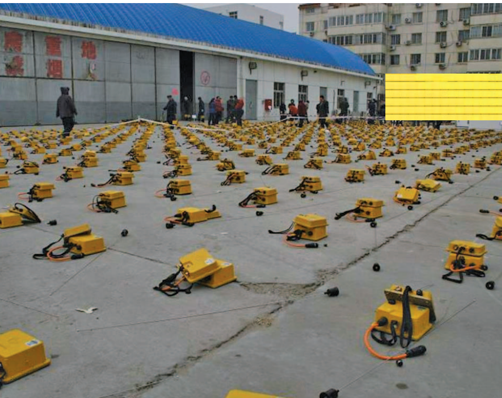
FireFly is laid out for commissioning prior to deployment in east central China.

where required, to over-sample or under-sample the geologic target to reach the optimal cost-benefit trade-off of the project.