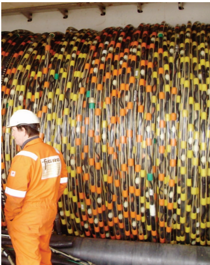
Figure 1. DigiSTREAMER installation on Fugro-Geoteam vessel in April.