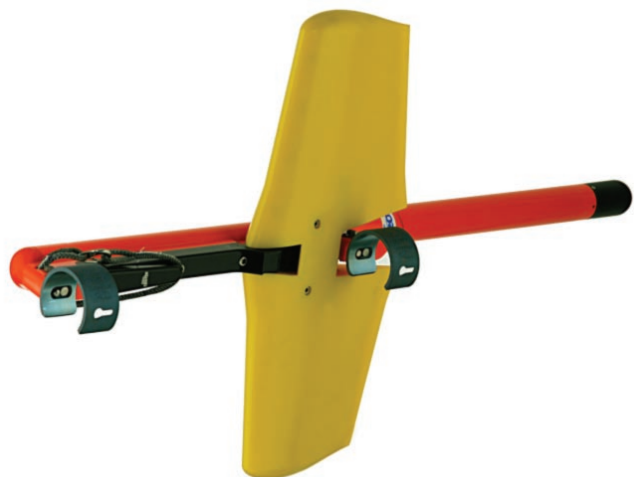
Figure 3. DigiFIN lateral control.

four months of operation. The solid active sections reduce environmental exposure and the uniform ballast is designed to reduce workboat activity.