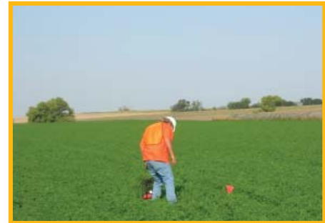
Crew deploying equipment in agriculturally sensitive areas.